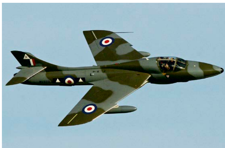
A photo of the 'Shoreham Hunter' in happier times. The aircraft was destroyed in 2015 at a UK airshow in a tragic accident claiming 11 lives.

Starting with the last one first, planes fly to bits because they have exceeded their design limitations, or due to a mechanical failure. It would be easy to assume there will never be a mechanical failure, but the reality is that we must always have that possibility in the back of our mind - planes get old, damage occurs, fatigue can happen. Sometimes, a mechanical failure can occur from an earlier 'event', such as over-stressing the aircraft. Other times it can be just a gradual deterioration in the aircraft structure - this is particularly the case with wooden aircraft, but corrosion can severely affect the structural integrity of aluminium aircraft as well. Some failures will be random, such as many engine problems like a blown crankcase seal or magneto failure. In any case, regardless of whether you are flying acrobatically or not, do you have a contingency plan to cover this? Are you high enough, and/or fast enough to buy time to recover the situation. Sadly, in some aerobatic accidents, this has